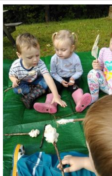
Toasting marshmallows on the campfire.

We would firstly like to welcome you all back to Chestnut Playgroup, and a big welcome to all our new families. The children have all settled in amazingly and we are very proud of the children supporting their new peers and already building new friendships.