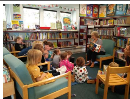
Enjoying Linton library story time.